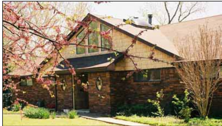
Transitional Living Centers